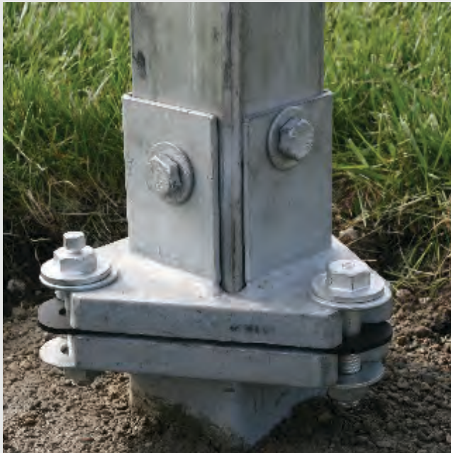
REDI-TORQUE SLIP BASE SYSTEM

The Omni-directional hinge assembly for multiple posts assists the structure in moving out of the way of a vehicle caused by an impact and helps reduce damage to the sign panel and vehicle.