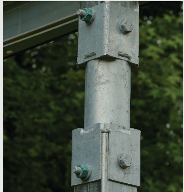
OMNI-DIRECTIONAL HINGE ASSEMBLY