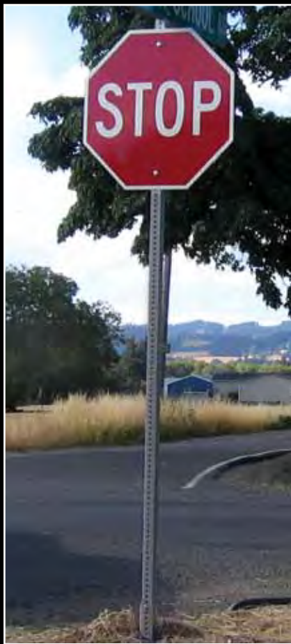
Standard Steel Post

Bright retro-reflective post cover improves day & night visibility...quickly & inexpensively