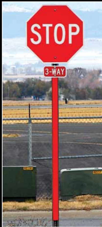
Reflector in Daylight