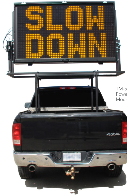
TM-548 with optional Powertilt and Bed Floor Mountings

Ver-Mac's TM-548 is a full-matrix truck-mounted message sign that is powered from the trucks battery. The TM-548 offers full graphic capability including several one touch arrow and directional display and sequencing functions. The TM-548 features the innovative V-Touch controller that plugs into the cigarette lighter and a manual up/down bracket. The TM-548 is ideal for highway construction and maintenance crews, highway stripping trucks, highway emergency and helper trucks.