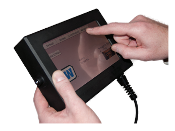
Metro signs feature an easy-to-use touchscreen controller